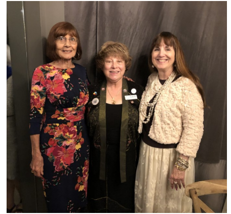
Best wishes to our friends at the Coral Springs Woman's Club on their milestone anniversary!